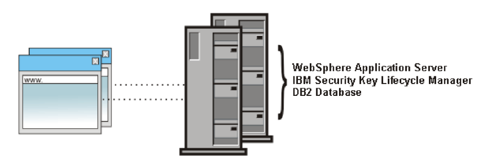
Figure 3. Primary and replica IBM Security Key Lifecycle Manager server

On Windows, Linux, or AIX systems, both computers must have the required memory, speed, and available disk space to meet the workload. The operating system and middleware components must be the same on both computers. The installation paths must also be the same.