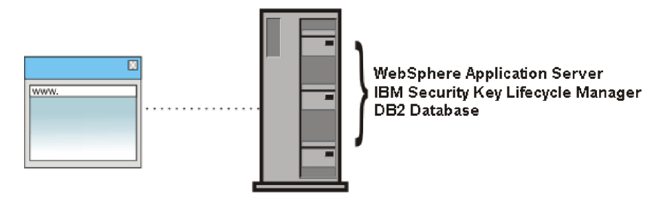
Figure 2. Main components on Windows systems and systems such as Linux or AIX

IBM Security Key Lifecycle Manager can run on a member server in a domain controller environment, but is not supported on a primary or backup domain controller.